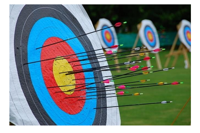
Figure 4 gives us a way to understand objectives. The archer is poised to shoot the arrow at the target. We may presume the archer will hit the target when they shoot the arrow. We may believe the archer can hit the target – that is, they possess the ability or competency to shoot the arrow accurately. However, we cannot assess the archer's skills before they release the arrow because we have nothing to measure yet.

Figure 5 demonstrates an outcome and its assessment. The placement of the arrows on the target provides evidence allowing us to measure the archer's skill.