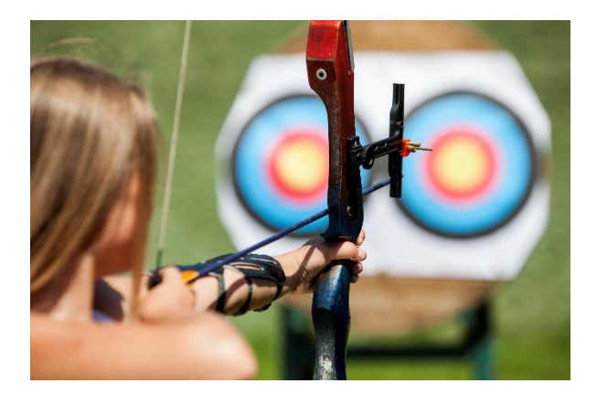
FIGURE 5 MEASURABLE SCORE