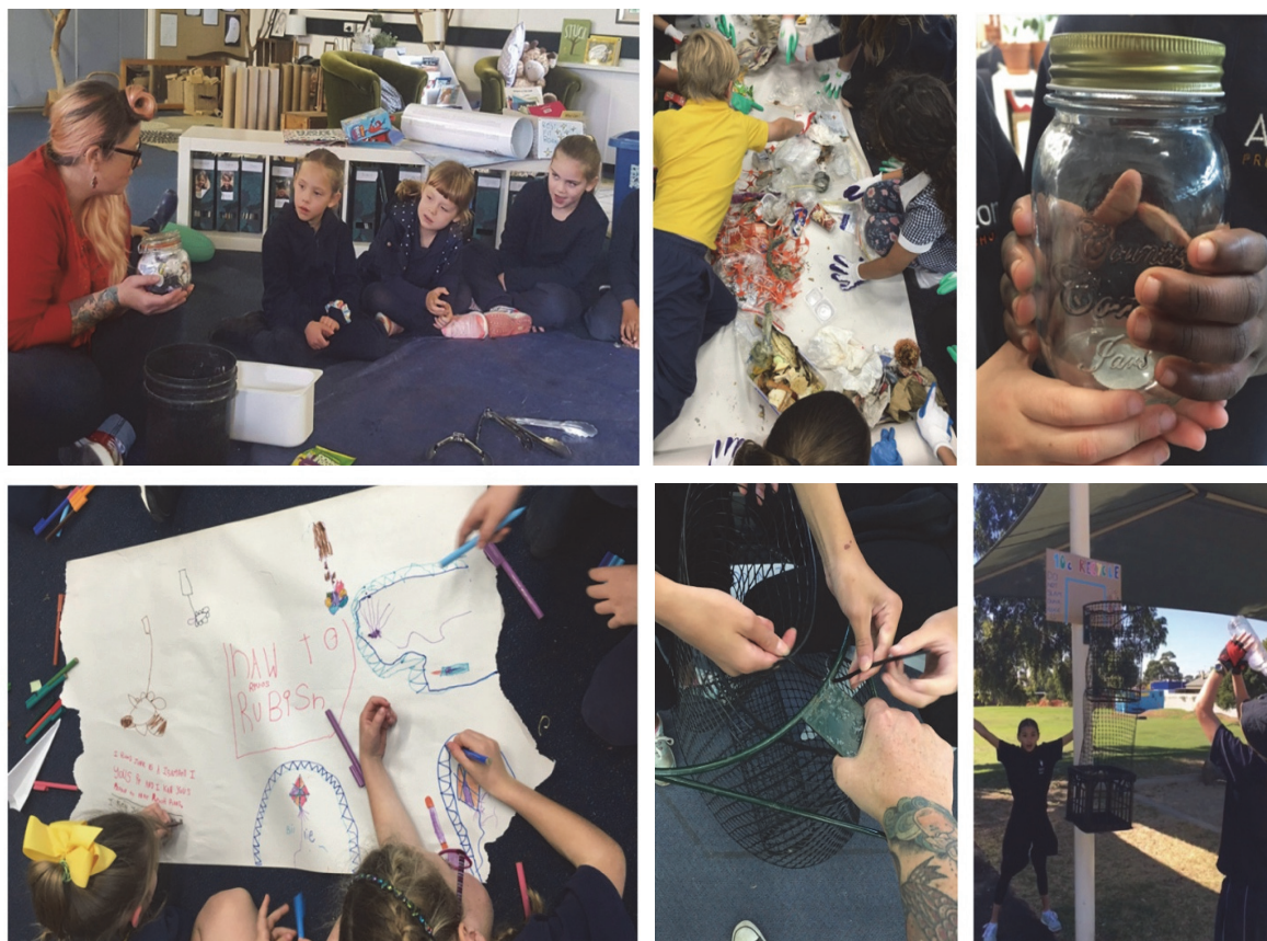
FIGURE 5 EXPERIENTIAL PROVOCATIONS AND EMERGENT PROJECTS, FROM THE RETHINK RUBBISH PROJECT AS PART OF MY PHD

One such project aims to shift students from consumers to contributors by building connections between the classroom, the garden and the canteen. Each class will plan, plant and prepare a meal for their peers, they will serve it to them and will later be in receipt of a meal that is planned, planted, prepared and served to them by another class group. The project draws connections back to the curriculum through traditional lessons such as maths, economics, biology and life sciences all of which are contextualised in the garden and kitchen, and in the process, students will also learn sustainable life skills around food production and preparation while practicing reciprocity, cooperation, planning and project management. Student participation in experiential sustainability learning nurtures values of