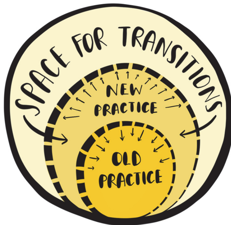
FIGURE 6 CURATING SPACE FOR TRANSITION DESIGN BY ENVELOPING THE OLD WITH THE NEW: THIS DRAFT MODELLING CONCEPT IS BEING EXPLORED WITHIN MY PHD RESEARCH AS AN APPROACH TO MANAGING TRANSITIONS IN PRACTICE

The funding balancing-act is currently being explored through Flourishing Fleurieu , where a number of local circular economy food and farming innovation projects form part of the vision for this community. The short-term aim is to open a food hub that is supported by region-specific social enterprises that can decrease the food hub's reliance on funding through grants. Curation has permitted space for this exploration to occur in the hopes that documenting this community-based work may also provide valuable insights into financing transitions.