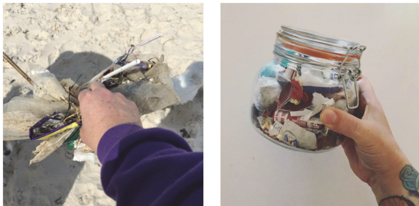
FIGURE 1 DAILY LITTER COLLECTION AS PART OF THE POLITICAL ACTION AGAINST WASTE AND THE LANDFILL WASTE PRODUCED DURING THE FIRST TWO YEARS OF MY ZERO WASTE TRANSITION

approach. Deeper engagement with problems and contexts through transformative and epistemic learning can create a kind of stickiness to theories presented in the literature which can forge pathways to action (Sterling, 2011). This shift from knowing into doing activates the ethico-political designer. This awakening can illuminate the sustainable potential in a brief, in turn loosening the double-bind causing action paralysis. It would appear that the rich experiences that formulated my transformation have sparked a mindset and posture shift which in turn facilitated the emergence of transition within my design practice. An ethico-political commitment fostered a praxis that catalysed a powerful practice-based transition—from designing ‘greener things’ towards designing against consumption through the practice of autonomous design and transition design.